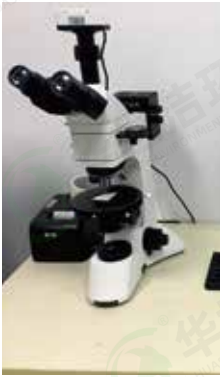
偏光显微镜 Polarizing microscope