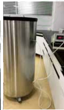
电荷密度测试仪 Charge density tester