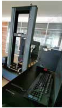
拉伸试验机 Tensile testing machine