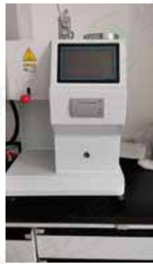
熔融指数仪 Melt index meter